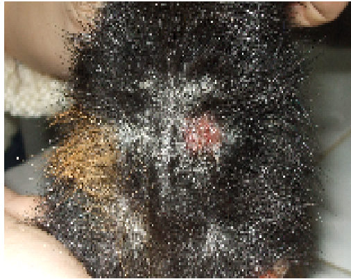
Fig. 1. Erythroderma, crusting, hair loss, induration and excoriations (original)

papules. Pruritus was intense as manifested by intense scratching, even during this period of time. The veterinarian had previously treated the animal with an antibiomatic and corticosteroid topical preparation without benefit. On examination, the trunk was the most severely affected area with generalized erythroderma, crusting, hair loss, induration and excoriations (figure 1). The dermatological exam was realized by skin scrapings. The samples were clarified in lactofenol and microscopically examined.