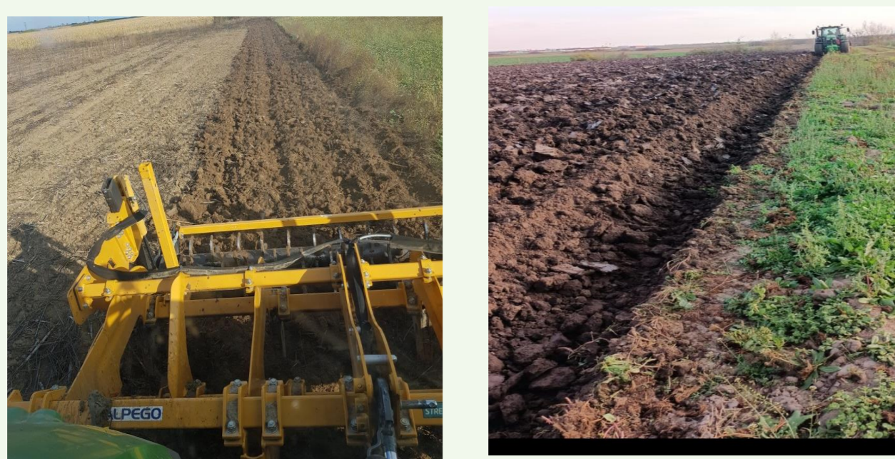
Figure 2. Soil work in the vegetable farm

Soil work. Agriculture is based on the basic works (ploughing or scarification) after the experience gained in the work, and the execution of all the works at the optimal time, for a low consumption of fuel and with minimal wear of the machines but also to achieve maximum efficiency.