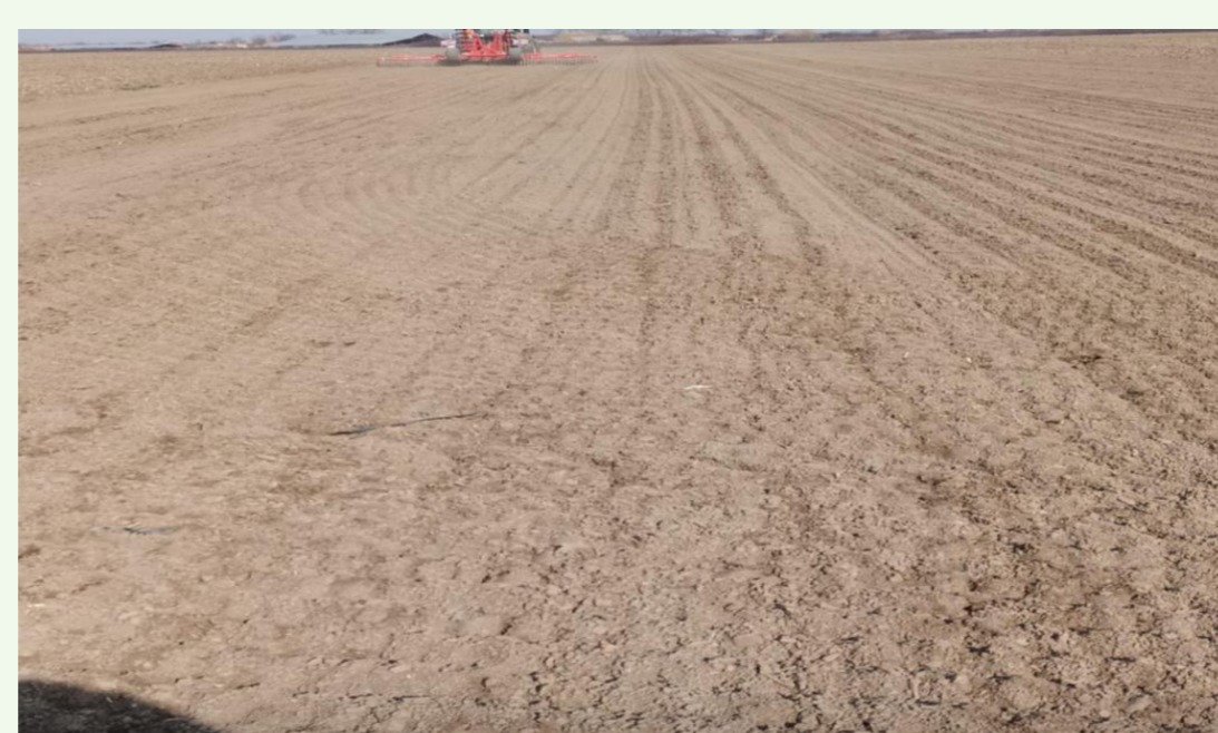
Figure 4. Preparation of the germinant bed within the vegetable farm