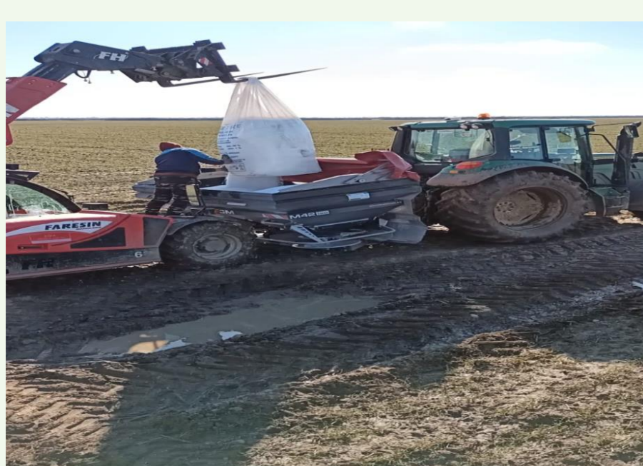
Figure 3. Fertilizer application in the vegetable farm