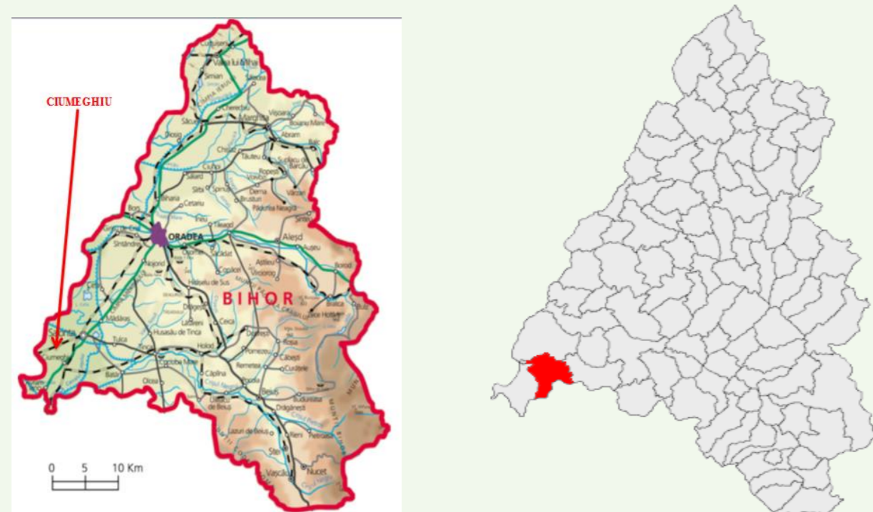
Figure 1 The location of Ciumeghiu commune on the map of Bihor county