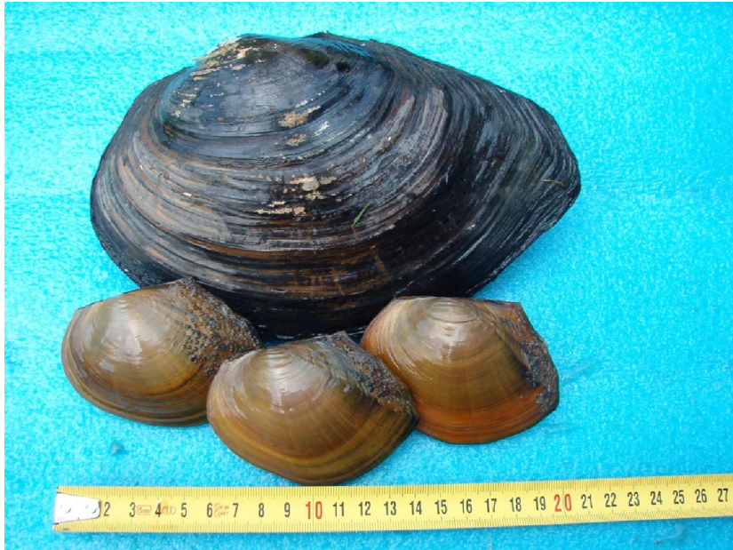
Fig. 1. Anodonta (Sinanodonta) woodiana

The main problems caused by Chinese pond mussel: