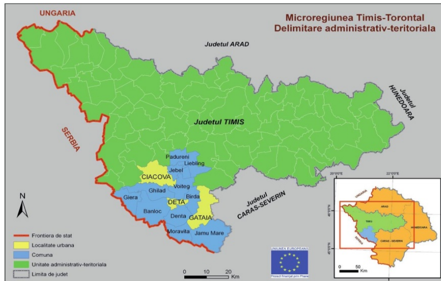
Fig. 1. Timiș-Torontal Microregion

The Microregion consists of 3 small towns that do not exceed 7.000 inhabitants each: Deta, Gătaia, Ciacova and 12 localities ranked as communes: Birta, Banloc, Denta, Giera, Ghilad, Jebel, Jamu Mare, Liebling, Livezile, Moravița, Pădureni and Voiteg.