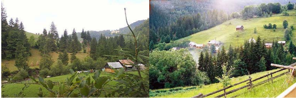
Images from Valley of Aries

Handicrafts and crafts were smaller due to the industrialization of areas nearby that have attracted labor. Handicraft production, with a low market, unsupported by adequate measures, is in a continue regress. There was no recovery network of artifacts from the Western Mountains.